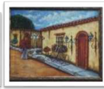
OBR-000219 AUTOR: LUIS A. QUIÑONEZ RD$5,500.00