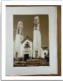
MYE-009540 AUTOR: CESAR PAYAMPS RD$5,000.00