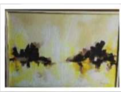
OBR-000014 AUTOR: CAROLINA CEPEDA RD$26,746.00