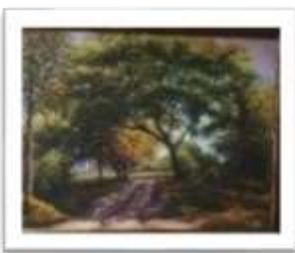
OBR-011716 AUTOR: GILBERTO CRUZ RD$90,000.00