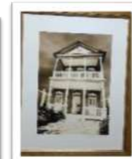
MYE-009543 AUTOR: CESAR PAYAMPS RD$5,000.00