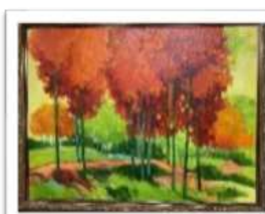
OBR-000188 AUTOR: MONSERRAT MUNNE RD$23,275.00