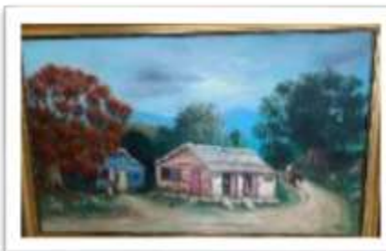
OBR-00027 AUTOR: JUAN EDUARDO RD$50,128.00