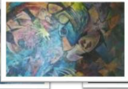
OBR-00078 AUTOR: VALENTIN ACOSTA RD$250,000.00