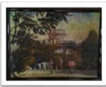
OBR-00074 AUTOR: WILLIAM POUERIET RD$20,000.00