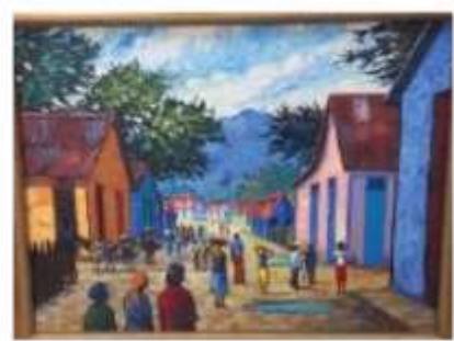
OBR-000183 AUTOR: RAFAEL AYBAR RD$15,000.00