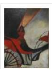
OBR-007935 AUTOR: FELA DE ANTUÑAMO RD$15,000.00