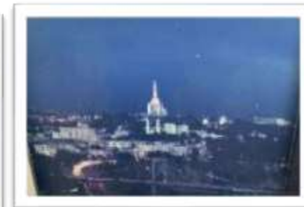
MYE-010024 AUTOR: VICTOR GOMEZ RD$4,000.00