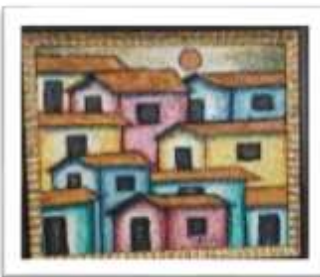
OBR-000216 AUTOR: RAFAEL MARTINEZ RD$3,500.00