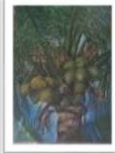
OBR-000192 AUTOR: IVETTE EGA RD$95,000.00