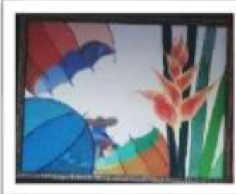
OBR-00029 AUTOR: CLAUDIO PACHECO RD$16,000.00