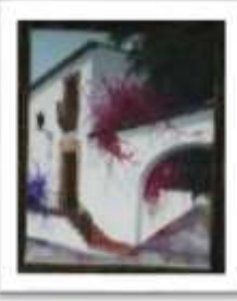
OBR-000053 AUTOR: LUIS OVIEDO RD$10,000.00