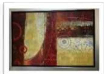
MYE-016326 AUTOR NO IDENTIFICADO RD$2,000.00