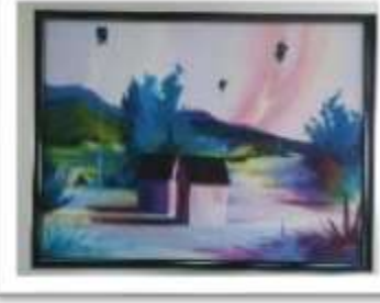
OBR-000055 AUTOR: MIGUEL DOMINGUEZ RD$18,000.00