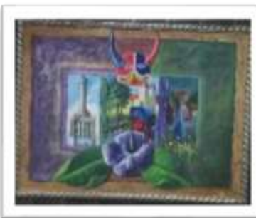
OBR-000217 AUTOR: LUIS A. QUIÑONEZ RD$5,500.00