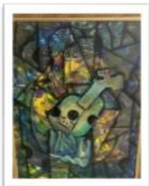
OBR-000189 AUTOR: JHOSY JIMENEZ RD$15,000.00