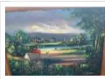
OBR-008509 AUTOR: + A CRUZ RD$5,000.00