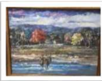
OBR-000128 AUTOR: VICTOR CHEVALIER RD$15,000.00