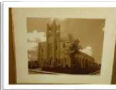
MYE-009621 AUTOR: CESAR PAYAMPS RD$5,000.00