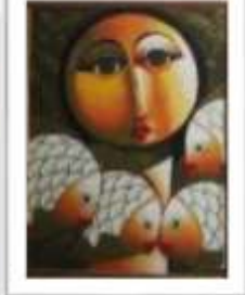
OBR-00092 AUTOR: RAFAEL M. RD$7,500.00