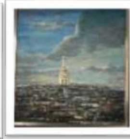
OBR-011809 AUTOR: VICTOR CHEVALIER RD$25,000.00