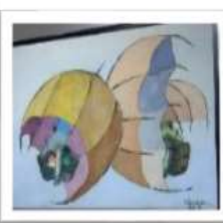
OBR-000007 AUTOR: CLAUDIO PACHECO RD$10,000.00