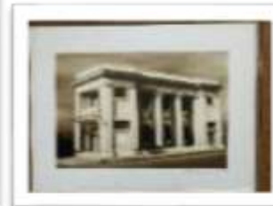
MYE-009626 AUTOR: CESAR PAYAMPS RD$5,000.00