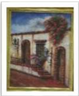
OBR-007887 AUTOR: BOLIVAR QUIÑONES RD$18,000.00