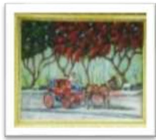
OBR-000050 AUTOR: BOLIVAR QUIÑONES RD$10,000.00