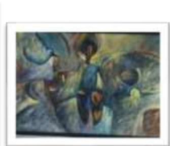
OBR-012990 AUTOR: JUAN BRAVO RD$15,000.00