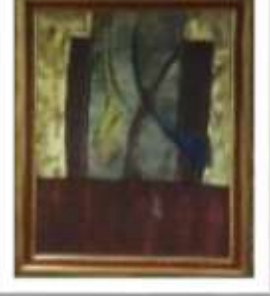
OBR-000067 AUTOR: LUZ SEVERINO RD$275,000.00