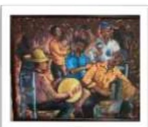
OBR-013439 AUTOR: JOSE MIGUEL PEÑA RD$5,750.00