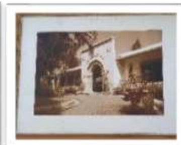
MYE-009619 AUTOR: CESAR PAYAMPS RD$5,000.00