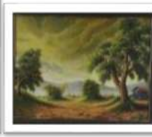
OBR-000220 AUTOR: MAX ARIAS RD$8,000.00