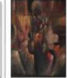
OBR-011718 AUTOR: JUAN BRAVO RD$40,000.00