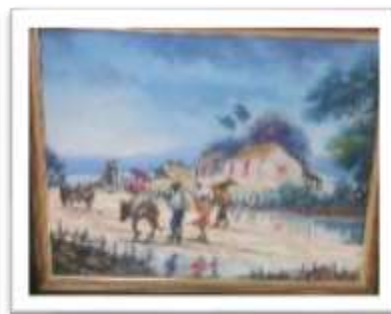
OBR-000211 AUTOR: JUAN RODRIGUEZ RD$50,000.00