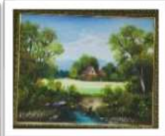
OBR-00028 AUTOR: SONIA VALERIO RD$5,000.00