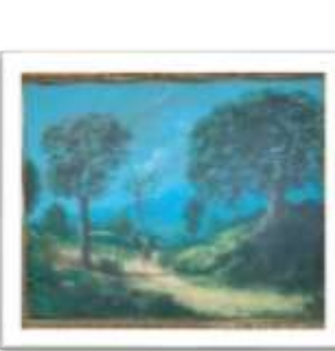
OBR-000026 AUTOR: JUAN EDUARDO RD$24,100.00