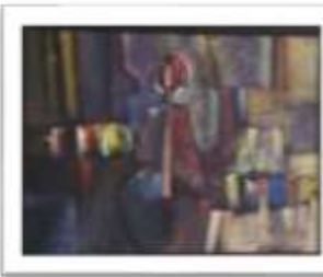
OBR-011717 AUTOR: JUAN BRAVO RD$40,000.00