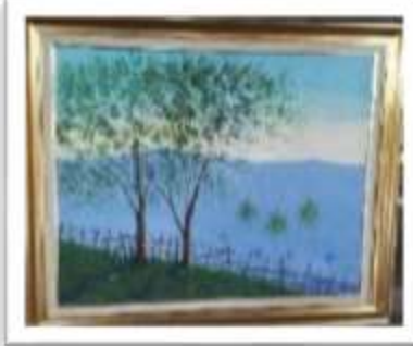
OBR-000004 AUTOR: EUSEBIO VIDAL RD$7,000.00