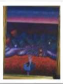
OBR-000061 AUTOR: DIONISIO BLANCO RD$40,000.00