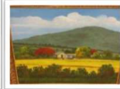
OBR-000199 AUTOR: EDUARDO RODRIGUEZ RD$15,000.00