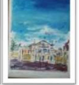
OBR-000057 AUTOR: JUAN CESTERO RD$25,000.00