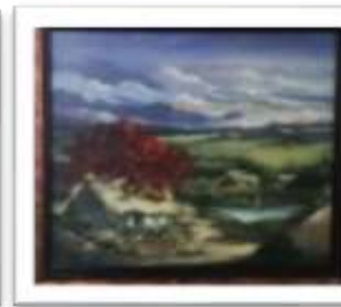
OBR-002209 AUTOR: ALBERTO HOUELLEMONT RD$22,000.00