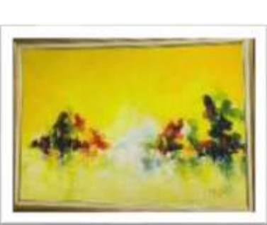
OBR-000024 AUTOR: CAROLINA CEPEDA RD$22,590.00