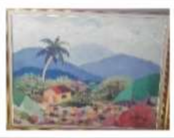
OBR-00045 AUTOR: CLAUDIO PACHECO RD$16,000.00