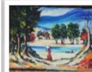
OBR-011725 AUTOR: UBALDO DOMINGUEZ RD$10,000.00