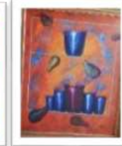
OBR-000139 AUTOR: BERNARDO T. RD$30,000.00