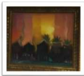
OBR-000020 AUTOR: GUILLO PEREZ RD$100,000.00