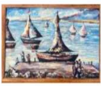
OBR-008510 AUTOR: UBALDO DOMINGUEZ RD$4,500.00