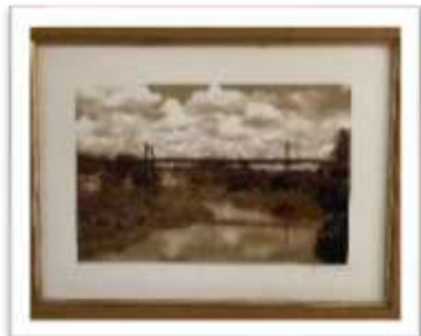
MYE-009544 AUTOR: CESAR PAYAMPS RD$5,000.00