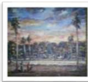
OBR-011808 AUTOR: VICTOR CHEVALIER RD$18,000.00