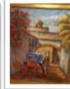
OBR-000197 AUTOR: BOLIVAR QUIÑONES RD$11,000.00