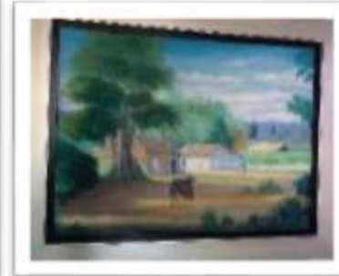
OBR-00041 AUTOR: + A CRUZ RD$6,640.00