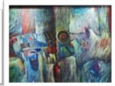
OBR-012989 AUTOR: JUAN BRAVO RD$22,000.00