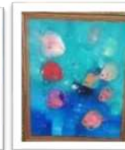
OBR-000138 AUTOR: MIGUEL PINEDA RD$6,000.00