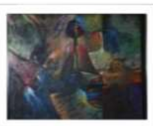
OBR-012991 AUTOR: JUAN BRAVO RD$17,000.00