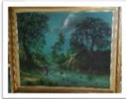
OBR-000001 AUTOR: JUAN EDUARDO RD$40,000.00