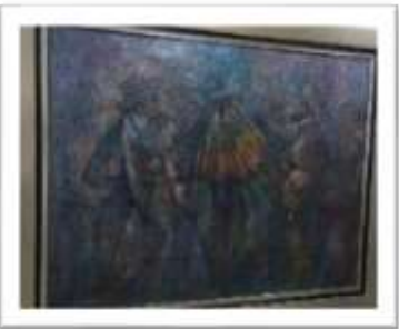
OBR-000066 AUTOR: NEY CRUZ RD$47,500.00