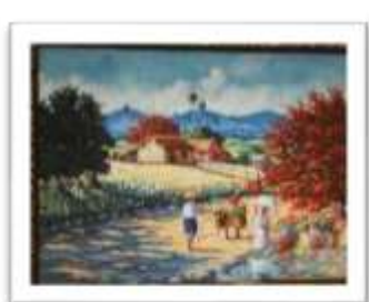
OBR-00090 AUTOR: CLAUDIO PEÑA RD$10,920.00