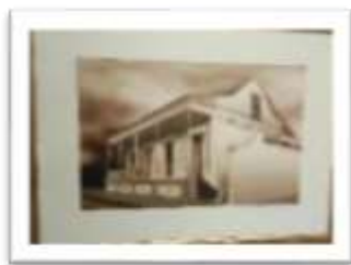
MYE-014983 AUTOR: CESAR PAYAMPS RD$5,000.00