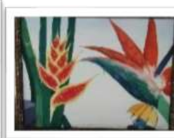
OBR-00030 AUTOR: CLAUDIO PACHECO RD$16,000.00