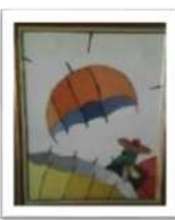
OBR-000023 AUTOR: CLAUDIO P. RD$10,000.00