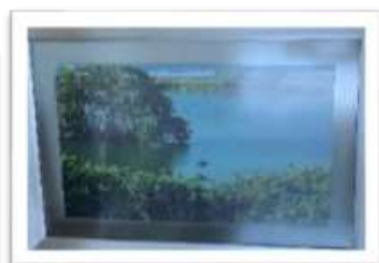
MYE-017072 PEDRO PIÑEYRO RD$5,000.00