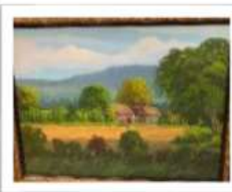
OBR-000201 AUTOR: EDUARDO RODRIGUEZ RD$15,000.00