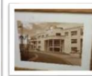
MYE-009633 AUTOR: CESAR PAYAMPS RD$5,000.00