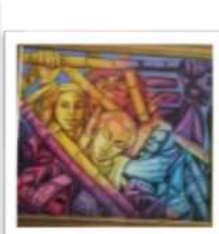
OBR-00086 AUTOR: JUSTO SUSANA RD$229,000.00