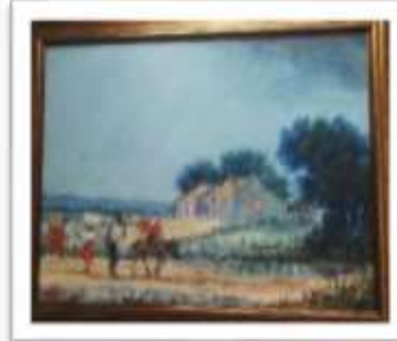
OBR-00039 AUTOR: JUAN RODRIGUEZ RD$50,000.00