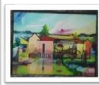
OBR-000218 AUTOR: MIGUEL DOMINGUEZ RD$18,000.00