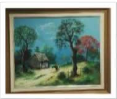
OBR-000010 AUTOR: JUAN EDUARDO RD$12,050.00