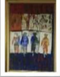
OBR-000068 AUTOR: LUZ SEVERINO RD$275,000.00