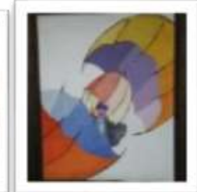
OBR-00031 AUTOR: CLAUDIO PACHECO RD$10,000.00