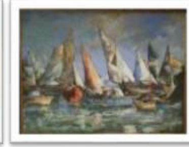
OBR-011820 AUTOR: VICTOR CHEVALIER RD$18,000.00