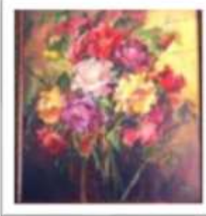
OBR-000191 AUTOR: IVETTE EGA RD$90,000.00