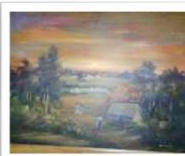
OBR-008512 AUTOR: + A CRUZ RD$6,000.00