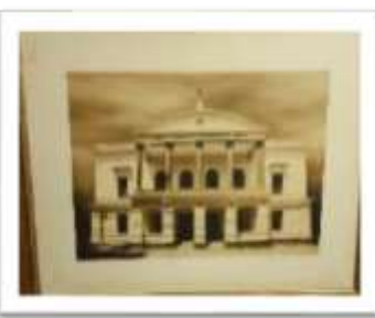
MYE-009539 AUTOR: CESAR PAYAMPS RD$5,000.00