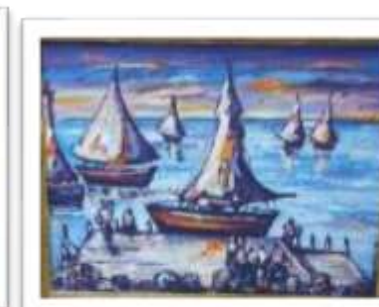
OBR-008307 AUTOR: UBALDO DOMINGUEZ RD$4,500.00