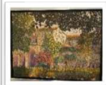
OBR-000151 AUTOR: WILLIAM POUERIET RD$26,000.00