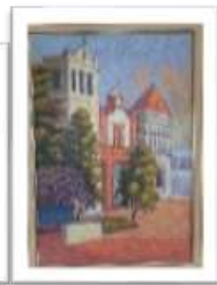
OBR-002281 AUTOR: AMAURYS REYES RD$30,000.00