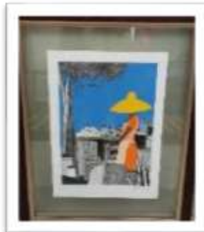
MYE-009898 AUTOR: LUIS AMOR RD$10,000.00