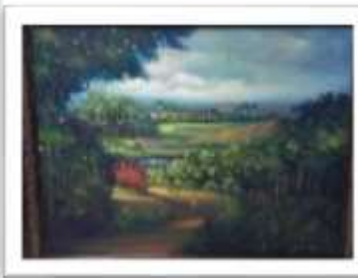
OBR-007884 AUTOR: + A CRUZ RD$7,500.00