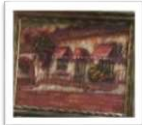
OBR-000115 AUTOR: BOLIVAR QUIÑONES RD$11,000.00