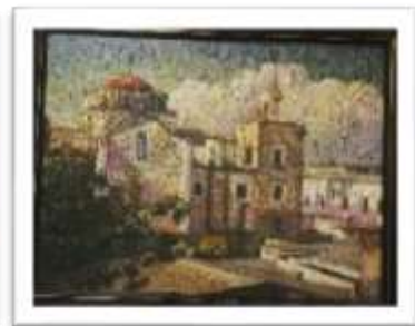
OBR-000135 AUTOR: WILLIAM POUERIET RD$18,000.00