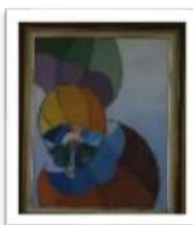
OBR-000017 AUTOR: CLAUDIO PACHECO RD$10,000.00