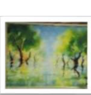
OBR-000025 AUTOR: CAROLINA CEPEDA RD$25,000.00