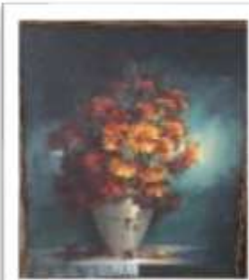
OBR-007943 AUTOR: ALBERTO HOUELLEMONT RD$10,000.00