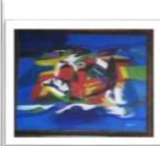
OBR-000140 AUTOR: PABLO PALASSO RD$25,000.00