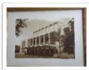
MYE-009545 AUTOR: CESAR PAYAMPS RD$5,000.00