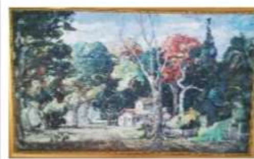
OBR-000186 AUTOR: VICTOR CHEVALIER RD$14,000.00