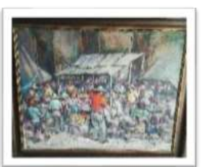
OBR-000064 AUTOR: NEY CRUZ RD$47,500.00