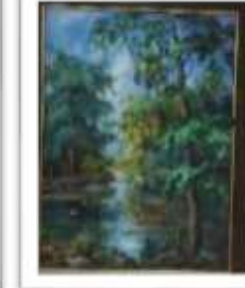
OBR-000144 AUTOR: IVETTE EGA RD$70,000.00