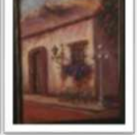
OBR-00105 AUTOR: BOLIVAR Q. RD$11,000.00