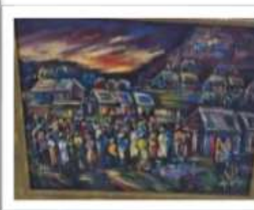
OBR-008306 AUTOR: UBALDO DOMINGUEZ RD$4,500.00