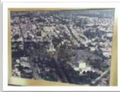
MYE-010023 AUTOR: VICTOR GOMEZ RD$4,000.00