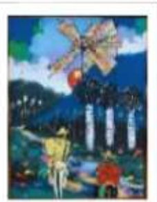
OBR-007888 AUTOR: CLAUDIO P. RD$16,000.00