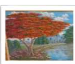
OBR-013522 AUTOR: RAFAEL SANTIAGO RD$20,000.00