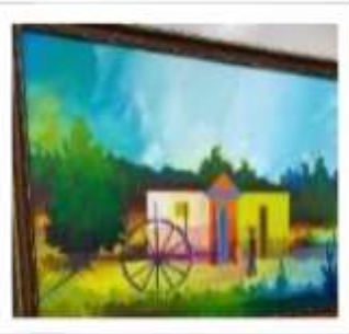
OBR-000200 AUTOR: MIGUEL DOMINGUEZ RD$18,000.00