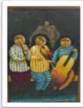
OBR-000212 AUTOR: RAFAEL MARTINEZ RD$7,500.00