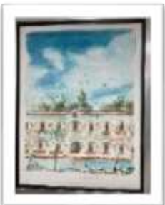
OBR-00044 AUTOR: JUAN CESTERO RD$25,000.00