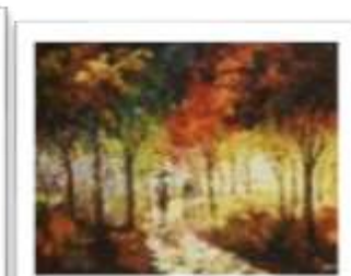
OBR-011806 AUTOR: GILBERTO CRUZ RD$54,000.00