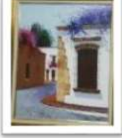
OBR-000054 AUTOR: LUIS OVIEDO RD$30,000.00