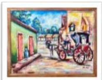
OBR-008508 AUTOR: UBALDO D. RD$4,500.00