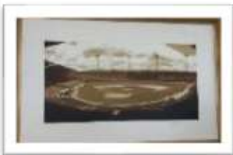
MYE-009635 AUTOR: CESAR PAYAMPS RD$5,000.00