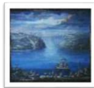
OBR-011807 AUTOR: VICTOR CHEVALIER RD$19,000.00