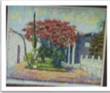
OBR-000058 AUTOR: AMAURYS REYES RD$40,000.00