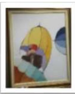
OBR-000022 AUTOR: CLAUDIO P. RD$10,000.00