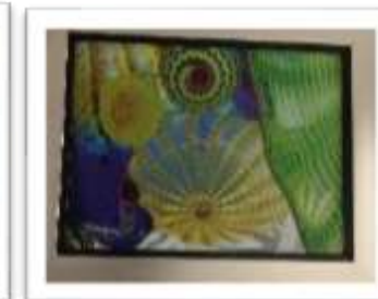
MYE-016323 AUTOR NO IDENTIFICADO RD$2,000.00