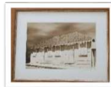
MYE-009620 AUTOR: CESAR PAYAMPS RD$5,000.00