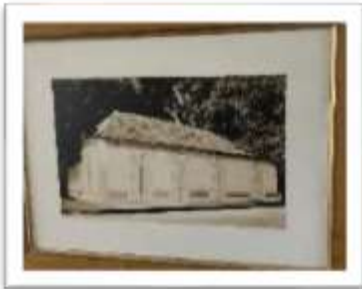
MYE-009536 AUTOR: CESAR PAYAMPS RD$5,000.00