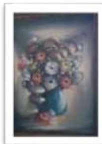
OBR-000141 AUTOR: + A CRUZ RD$4,000.00