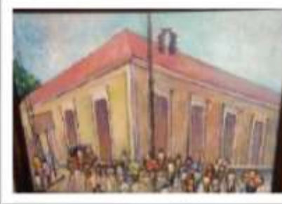
OBR-000204 AUTOR: NEY CRUZ RD$17,000.00