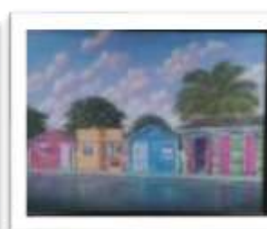
OBR-013524 AUTOR: RAFAEL SANTIAGO RD$20,000.00