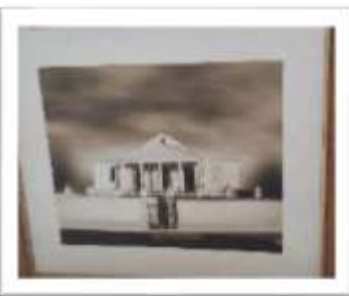
MYE-009623 AUTOR: CESAR PAYAMPS RD$5,000.00