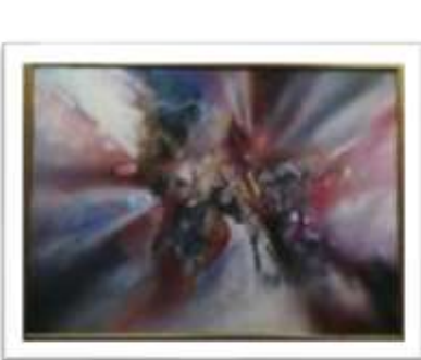
OBR-00081 AUTOR: JUAN BRAVO RD$40,000.00