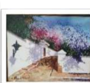
OBR-007945 AUTOR: LUIS OVIEDO RD$17,500.00