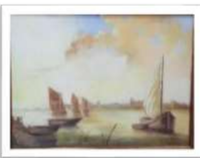
OBR-000210 AUTOR: MARINA ROSON RD$7,000.00