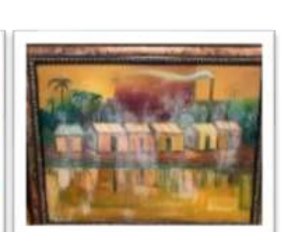
OBR-00088 AUTOR: WILLY PEREZ RD$32,500.00