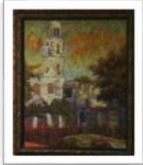
OBR-000059 AUTOR: AMAURYS REYES RD$18,500.00