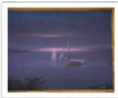
OBR-000209 AUTOR: + A CRUZ RD$13,500.00