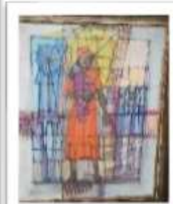
OBR-007944 AUTOR: CUQUITO PEÑA RD$75,000.00