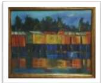
OBR-00089 AUTOR: WILLY PEREZ RD$22,500.00