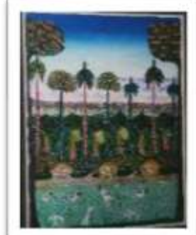
OBR-00085 AUTOR: JUSTO SUSANA RD$75,000.00