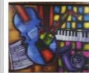
OBR-011719 AUTOR: CIPRIAN RD$12,000.00