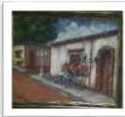
OBR-000131 AUTOR: BOLIVAR Q. RD$11,000.00