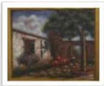
OBR-000114 AUTOR: BOLIVAR QUIÑONES RD$11,000.00