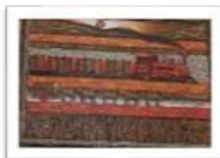
OBR-007950 AUTOR: RAFAEL MARTINEZ RD$12,500.00