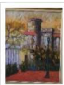
OBR-007936 AUTOR: AMAURYS REYES RD$24,000.00