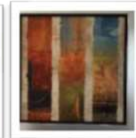
MYE-016322 AUTOR NO IDENTIFICADO RD$2,000.00