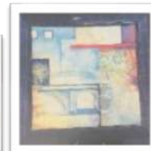
MYE-009629 AUTOR NO IDENTIFICADO RD$1,000.00