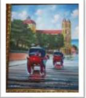
OBR-000060 AUTOR: FREDDY JAVIER RD$15,000.00