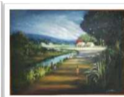
OBR-008513 AUTOR: + A CRUZ RD$6,000.00