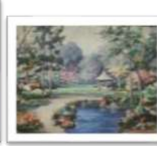
OBR-011822 AUTOR: VICTOR CHEVALIER RD$18,000.00