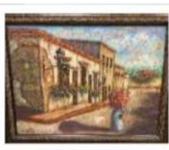
OBR-007952 AUTOR: BOLIVAR QUIÑONES RD$18,000.00