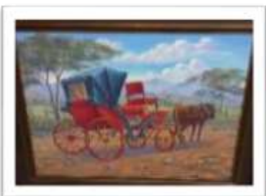
OBR-00034 AUTOR: RAFAEL SANTIAGO RD$18,000.00