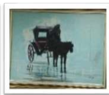
OBR-000019 AUTOR: JUAN EDUARDO RD$40,000.00