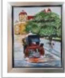
OBR-00102 AUTOR: CARLOS M. GRULLON RD$22,500.00