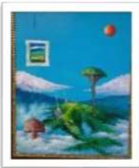
OBR-000215 AUTOR: LEO GUTIERREZ RD$10,000.00