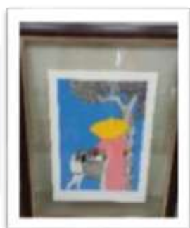
MYE-009897 AUTOR: LUIS AMOR RD$10,000.00