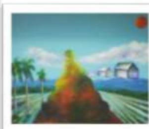
OBR-010765 AUTOR: HECTOR REYNOSO RD$10,000.00