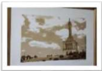
MYE-009634 AUTOR: CESAR PAYAMPS RD$5,000.00