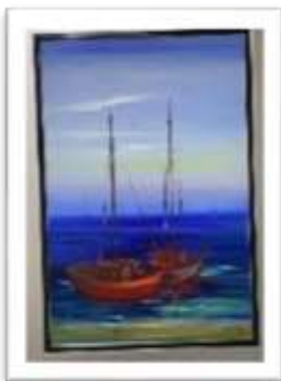
OBR-000190 AUTOR: WILLY PEREZ RD$37,500.00