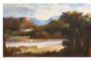
OBR-000202 AUTOR: JONAS RODRIGUEZ RD$9,000.00