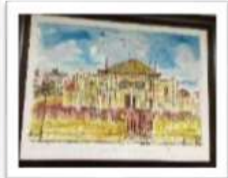
OBR-00048 AUTOR: JUAN CESTERO RD$25,000.00