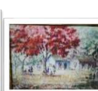
OBR-007948 AUTOR: VICTOR CHEVALIER RD$14,000.00