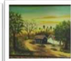
OBR-013525 AUTOR: MARCOS GUZMAN RD$5,000.00