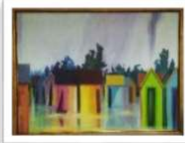
OBR-00046 AUTOR: MIGUEL DOMINGUEZ RD$10,000.00