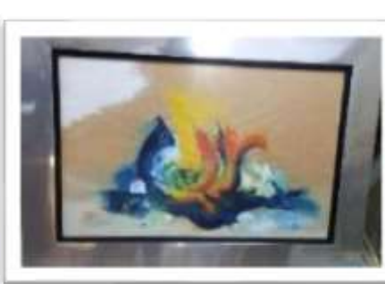
OBR-000008 AUTOR: CAROLINA CEPEDA RD$25,000.00