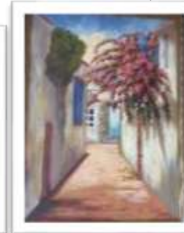
OBR-000205 AUTOR: AMAURYS REYES RD$40,000.00