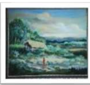
OBR-00077 LAMINA RETOCADA RD$12,500.00