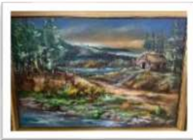
OBR-00043 AUTOR: IVETTE EGA RD$30,000.00