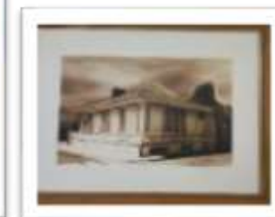
MYE-014982 AUTOR: CESAR PAYAMPS RD$5,000.00