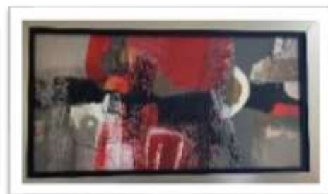
MYE-016318 AUTOR: MAURICIO PIOVAN RD$2,000.00