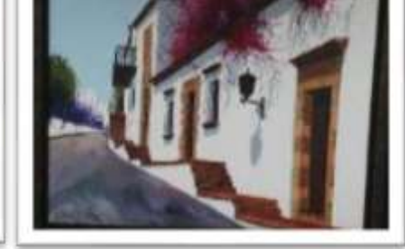
OBR-000056 AUTOR: LUIS OVIEDO RD$10,000.00