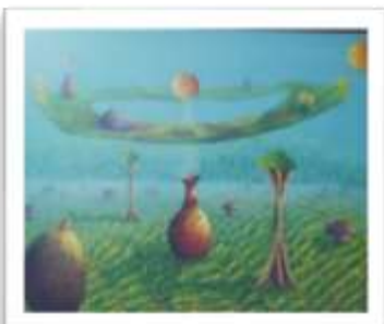
OBR-010764 AUTOR: HECTOR REYNOSO RD$10,000.00