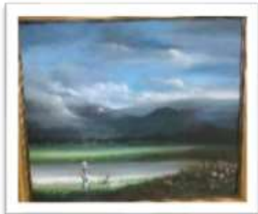
OBR-000180 AUTOR: ALBERTO HOUELLEMONT RD$50,000.00