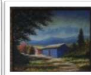
OBR-013526 AUTOR: JOHNNY SEGURA RD$12,500.00