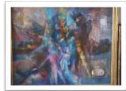
OBR-000065 AUTOR: NEY CRUZ RD$27,000.00