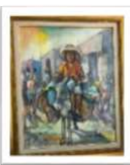
OBR-000063 AUTOR: NEY CRUZ RD$9,000.00