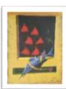
OBR-000136 AUTOR: BERNARDO THEN RD$30,000.00