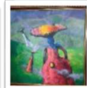
OBR-000133 AUTOR: CHIQUI MENDOZA RD$318,000.00