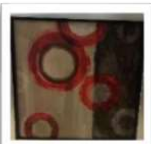
MYE-016319 AUTOR NO IDENTIFICADO RD$2,000.00