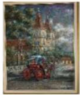
OBR-000181 AUTOR: BOLIVAR QUIÑONES RD$18,000.00