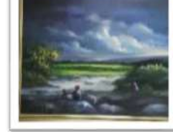
OBR-00104 AUTOR: ALBERTO HOUELLEMONT RD$50,000.00