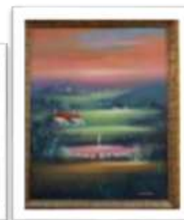
OBR-007886 AUTOR: + A CRUZ RD$3,200.00