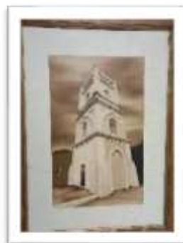
MYE-009624 AUTOR: CESAR PAYAMPS RD$5,000.00