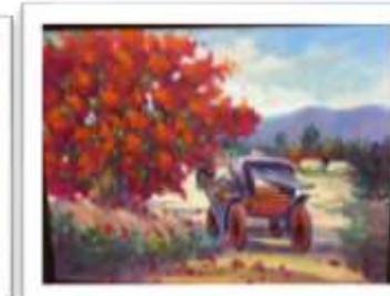
OBR-010773 AUTOR: + A CRUZ RD$9,500.00