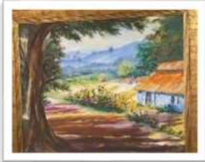
OBR-000062 AUTOR: MARIO GRULLÓN RD$26,850.00