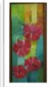
OBR-000142 AUTOR: MIGUEL P. RD$14,000.00