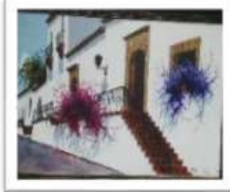
OBR-002282 AUTOR: LUIS OVIEDO RD$20,000.00