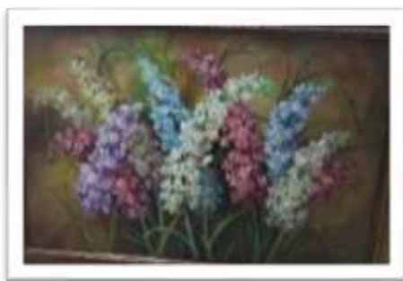
OBR-000208 AUTOR: IVETTE EGA RD$70,000.00