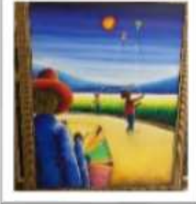
OBR-000070 AUTOR: ALBERTO LESTRAD RD$18,000.00