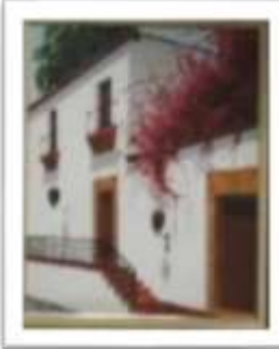
OBR-002283 AUTOR: LUIS OVIEDO RD$12,500.00