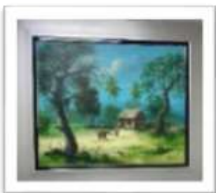
OBR-00033 AUTOR: JUAN EDUARDO RD$24,100.00