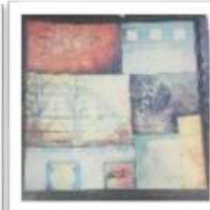
MYE-009630 AUTOR NO IDENTIFICADO RD$1,000.00