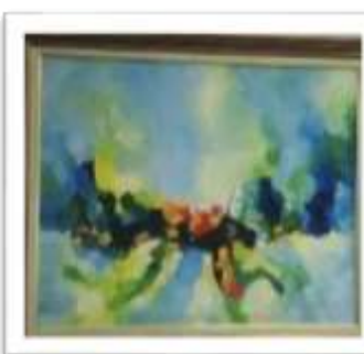
OBR-000018 AUTOR: CAROLINA CEPEDA RD$24,400.00