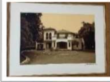
MYE-009541 AUTOR: CESAR PAYAMPS RD$5,000.00