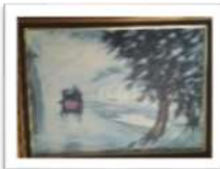
OBR-000106 AUTOR: YORYI MOREL RD$200.00