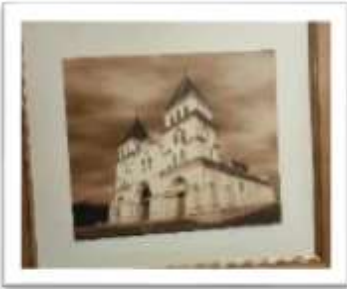
MYE-009538 AUTOR: CESAR PAYAMPS RD$5,000.00