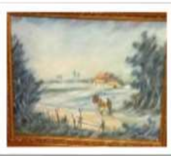
OBR-000002 AUTOR: JUAN RODRIGUEZ RD$50,000.00