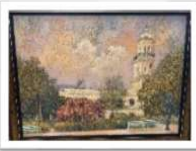
OBR-00075 AUTOR: WILLIAM POUERIET RD$20,000.00