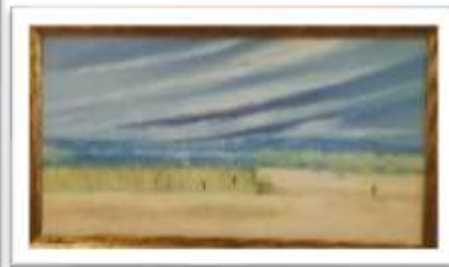
OBR-00042 AUTOR: DANIEL VARGAS RD$12,000.00