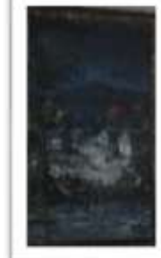
OBR-000143 AUTOR: CHEVALIER RD$15,000.00