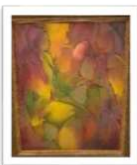
OBR-00082 AUTOR: AMAYA SALAZAR RD$330,000.00