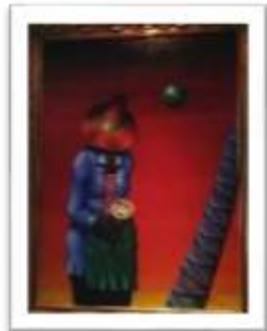
OBR-00080 AUTOR: DIONISIO BLANCO RD$40,000.00