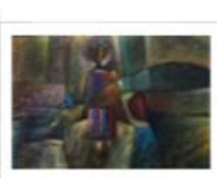
OBR-012992 AUTOR: JUAN BRAVO RD$15,000.00