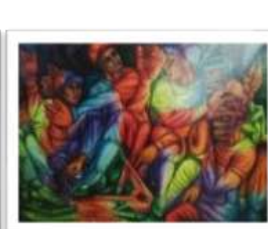
OBR-00087 AUTOR: JUSTO SUSANA RD$67,000.00