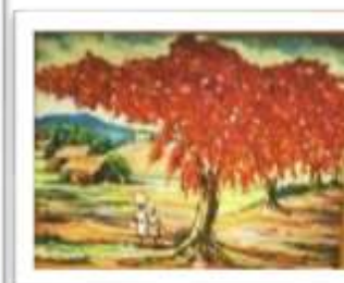
OBR-008515 AUTOR: UBALDO DOMINGUEZ RD$4,500.00