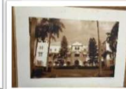
MYE-009542 AUTOR: CESAR PAYAMPS RD$5,000.00