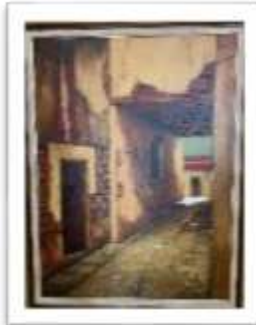
OBR-00038 AUTOR: CASTELLOTE RD$11,000.00