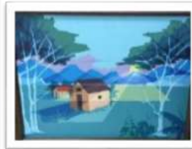
OBR-000193 AUTOR: NORBERTO SANTANA RD$67,000.00