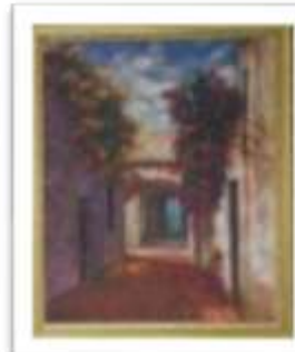
OBR-008121 AUTOR: BOLIVAR QUIÑONES RD$14,500.00