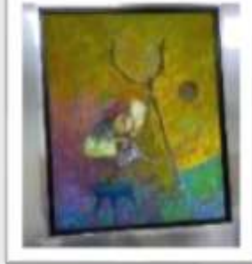
OBR-000071 AUTOR: SILVIO AVILA RD$125,000.00