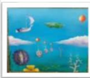
OBR-000213 AUTOR: LEO GUTIERREZ RD$10,000.00