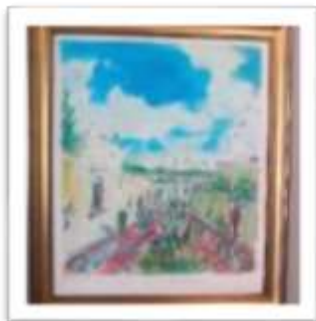
OBR-000009 AUTOR: JUAN CESTERO RD$22,500.00