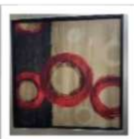
MYE-016320 AUTOR NO IDENTIFICADO RD$2,000.00