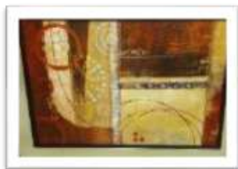
MYE-016325 AUTOR NO IDENTIFICADO RD$2,000.00