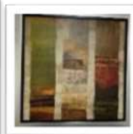
MYE-016321 AUTOR NO IDENTIFICADO RD$2,000.00