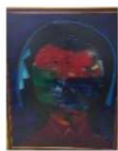
OBR-000185 AUTOR: MIGUEL ULLOA RD$70,000.00