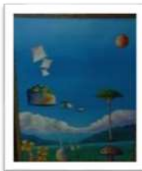
OBR-000214 AUTOR: LEO GUTIERREZ RD$10,000.00