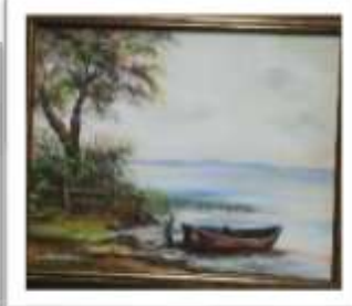
OBR-000203 AUTOR: YOSELINES DOMINGUEZ RD$5,000.00