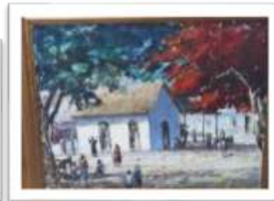
OBR-000132 AUTOR: VICTOR CHEVALIER RD$15,000.00