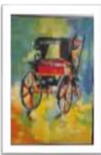
OBR-000021 AUTOR: CAROLINA RD$30,000.00