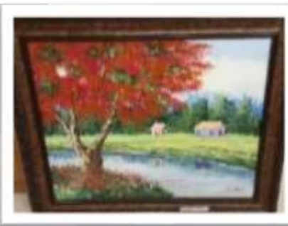
OBR-000003 AUTOR: TONY PEREZ RD$5,000.00