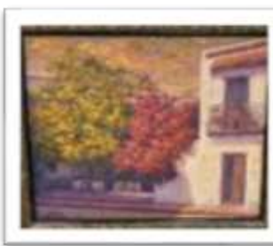
OBR-002208 AUTOR: ROBIN ROQUE GERMAN RD$7,750.00