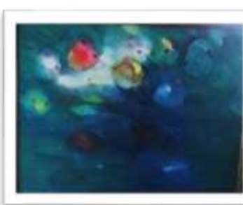
OBR-000137 AUTOR: MIGUEL PINEDA RD$8,500.00