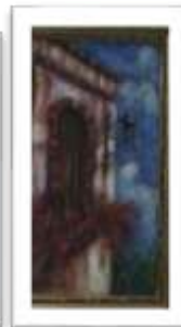
OBR-000129 AUTOR: BOLIVAR Q. RD$11,000.00