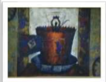
OBR-000147 AUTOR: BERNARDO THEN RD$30,000.00