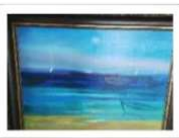
OBR-00091 AUTOR: WILLY PEREZ RD$21,500.00