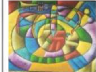
OBR-011720 AUTOR: CIPRIAN RD$12,000.00