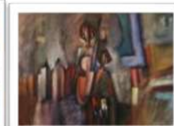
OBR-011805 AUTOR: JUAN BRAVO RD$26,600.00