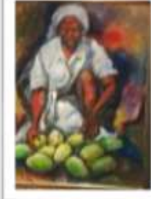
OBR-000148 AUTOR: NEY CRUZ RD$21,500.00