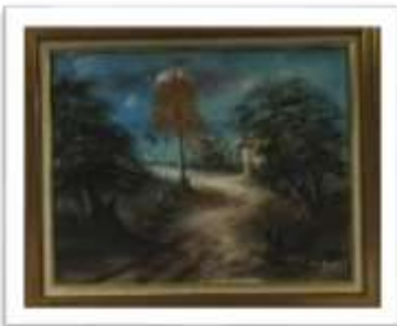
OBR-00036 AUTOR: RAMON ROSARIO RD$2,500.00