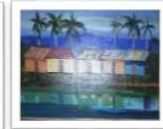
OBR-013528 AUTOR: WILLY PEREZ RD$21,500.00