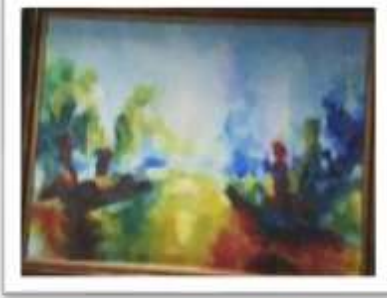
OBR-00076 AUTOR: CAROLINA CEPEDA RD$27,000.00