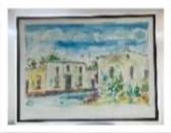
OBR-00049 AUTOR: JUAN CESTERO RD$25,000.00