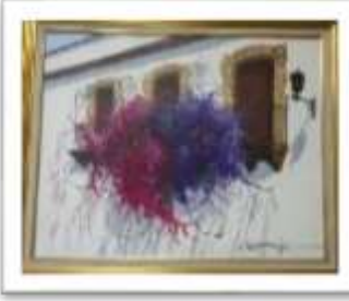
OBR-000052 AUTOR: LUIS OVIEDO RD$30,000.00