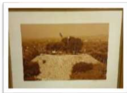
MYE-009625 AUTOR: CESAR PAYAMPS RD$5,000.00