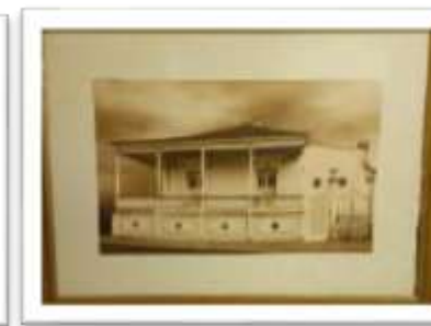
MYE-009622 AUTOR: CESAR PAYAMPS RD$5,000.00